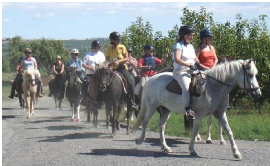
The Cascade Club's annual winery ride.