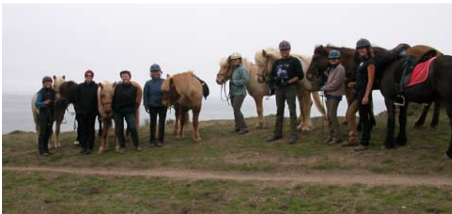
Another fun and well-attended club event was a ride along Point Reyes National Seashore.