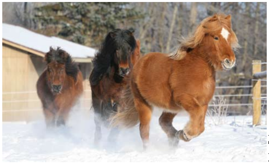
Kalman frá Lækjamóti (IS1995155106), and Víkingur frá Götu (IS1989184930) enjoy the snow at Sand Meadow Farm in January.