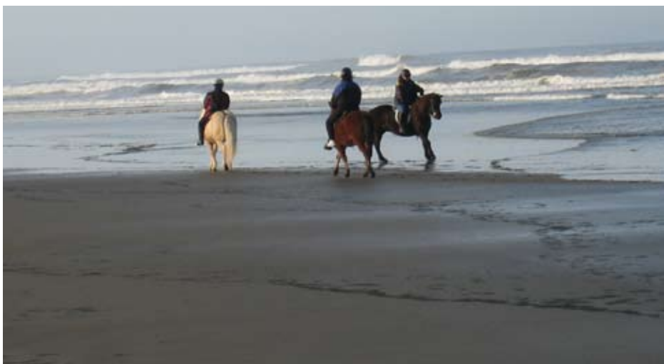
Scene from the Cascade Club's October beach ride.

created the store and has invited any suggestions. Happy shopping!