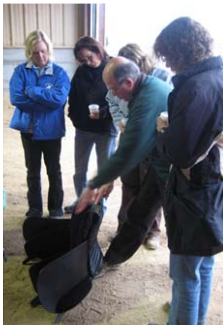
The ins-and-outs of evaluating a saddle was the subject of one seminar.

The timing for organizing, advertising, and marketing the seminars ended up being a little shorter than we hoped for, but everybody involved was very helpful, all the clinicians were extremely accommodating and flexible, and with interested, eager-to-learn participants the results exceeded our expectations.