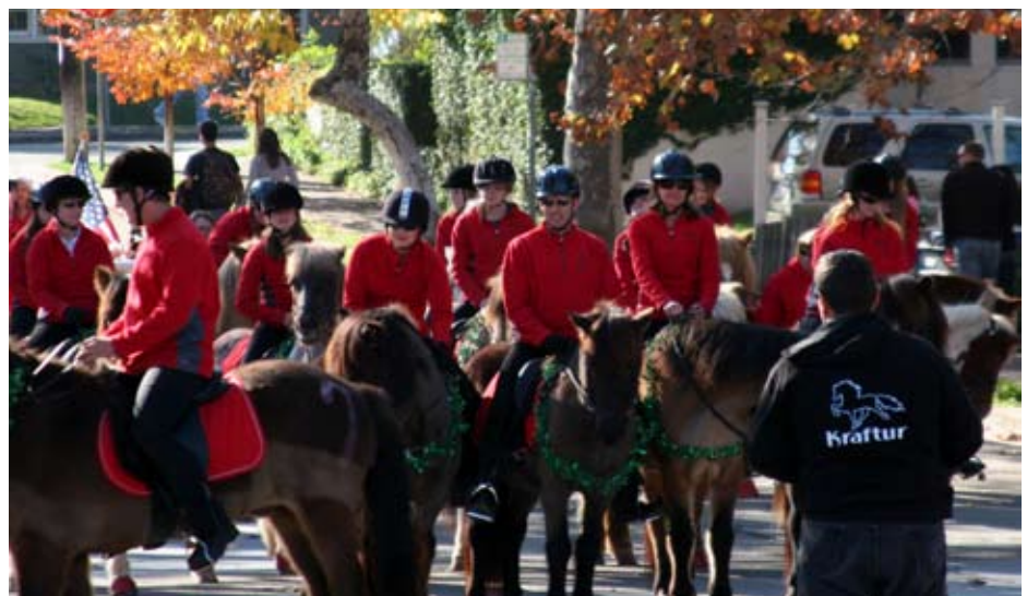
Twenty-five Kraftur members were on hand for the Los Gatos Children's Christmas Parade, with 17 of them riding.

Between the competitions and clinics, Kraftur members regularly rode together in small and large groups on the wide variety of trails on