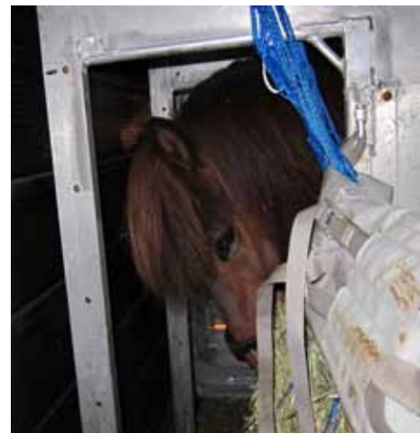
Kaliber fra Laekjarbotnum peering through the groom's door in the container.

Answer: Norway. The Norwegian horses traveled for nearly 36 hours, including 20 hours on a ferry to reach the World Championships.