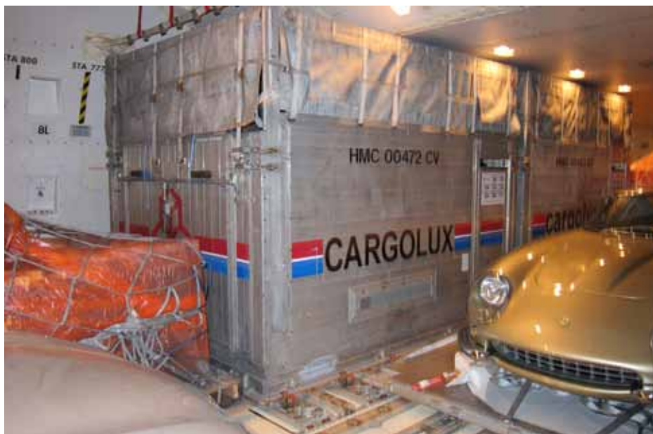
How did the U.S. horses get to the World Championships? In the container shown here in the back. Their tack is in front of the containers, wrapped in orange plastic.

Trivia Question: Which team horses of the 14 nations competing at the World Championships in Austria had the longest trip measured in actual hours traveled, not distance?