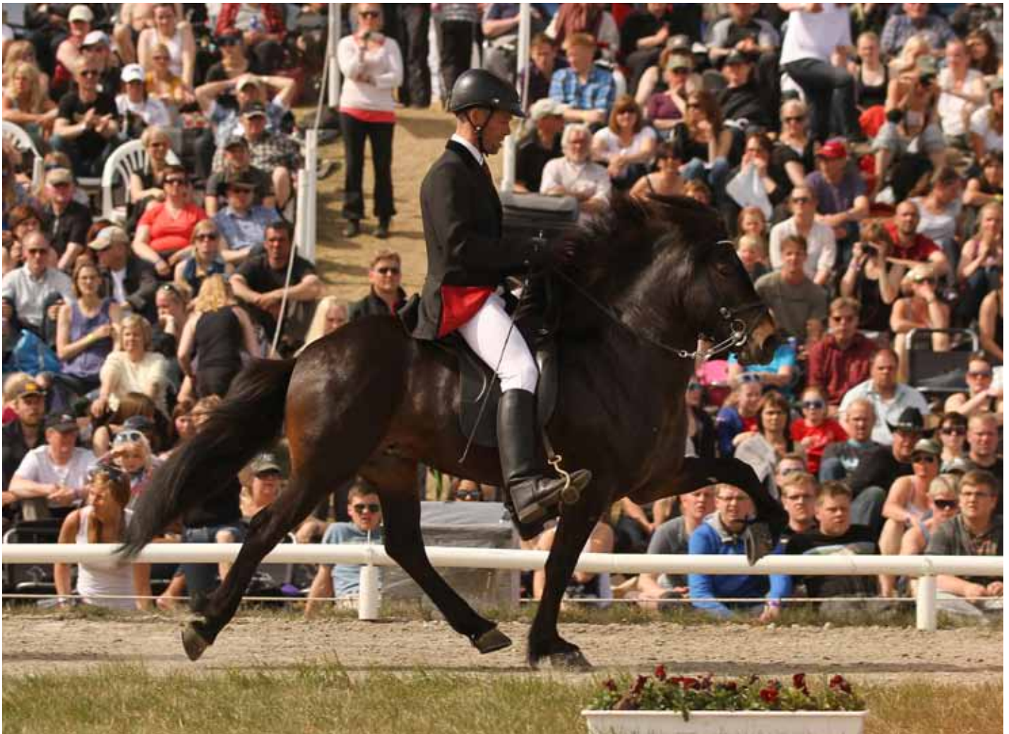
Spuni fra Vesturkoti wowed the audience with his fast tolt at the 2011 Landsmót in Iceland.