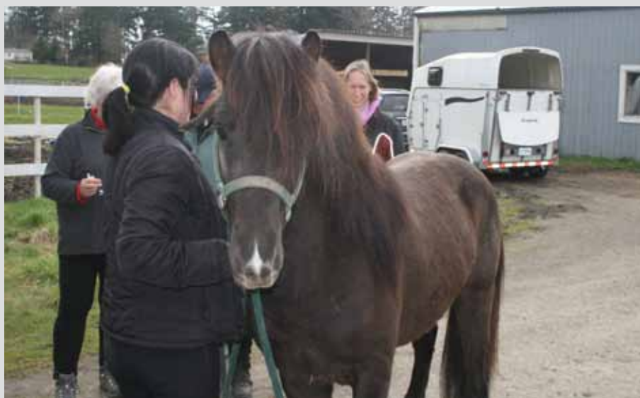
During the conformation clinic held in Battleground, WA, attendees assess the proportions of a young stallion and discuss how that is related to the ability to tolt.