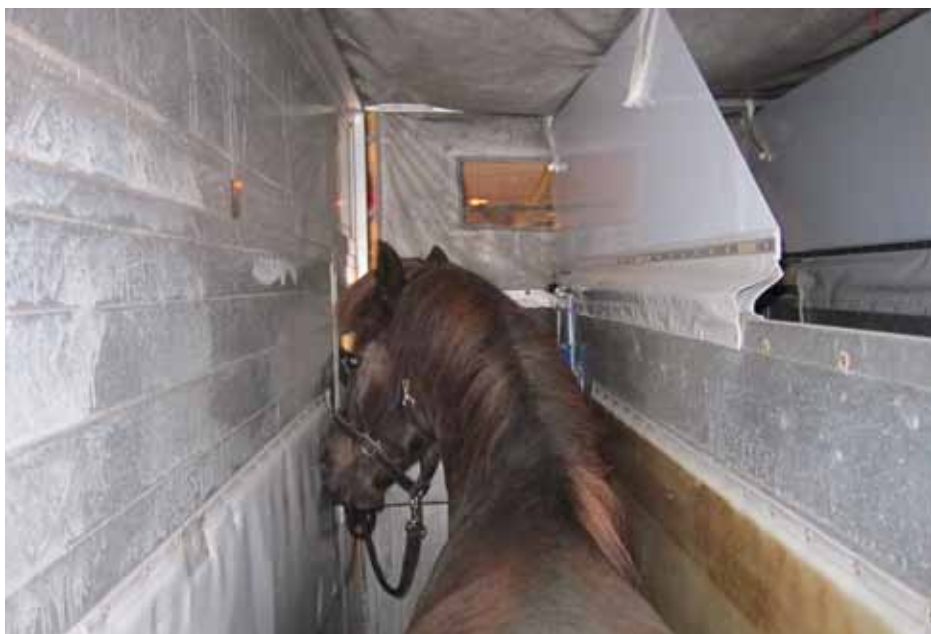
Dynjandi fra Dalvik in the air-freight container.