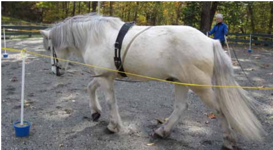
his photo shows how the set-up looks from the outside. It's only a visual aid, not a sturdy pen.

And why not simply put the horse in side reins?