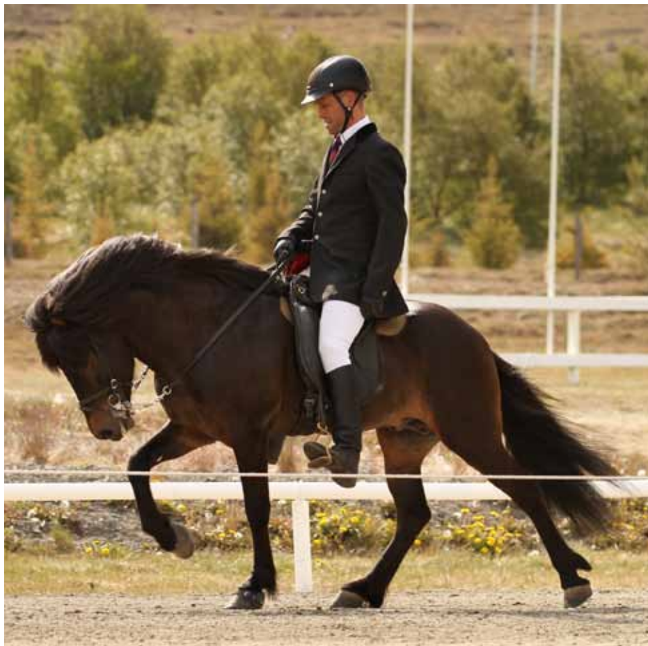
Spuni showing an elegant walk at the 2011 Landsmot in Iceland.

An alternative to this well-thought-out and deliberate approach is to simply breed the best to the best of unrelated horses. You can determine what is “best” by letting the breeding judges determine it for you. Look