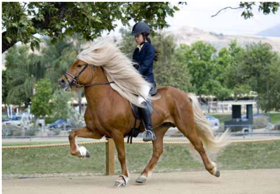
Erró frá Sléttubóli achieved a 9.5 for mane and tail, but that is just beauty on top of performance for a stallion who scored 8.0 for tolt, 8.0 for trot, 8.5 for pace, and 8.5 for spirit.

As the FEIF standards state, “The horse should be full of splendor and presence” (Antonsson, et al, 2011, p. E-10). The body should be light and cylindrical in shape. The front, middle, and hind portions of the horse should be approximately equal. The legs should be long. “The highest point at the withers should be higher than the highest point of the croup” (Antonsson, et al, 2011, p. E-10). Common flaws are legs that are too short; body is too round; horse is lower in the front; or front, mid, and hind sections are not proportional.