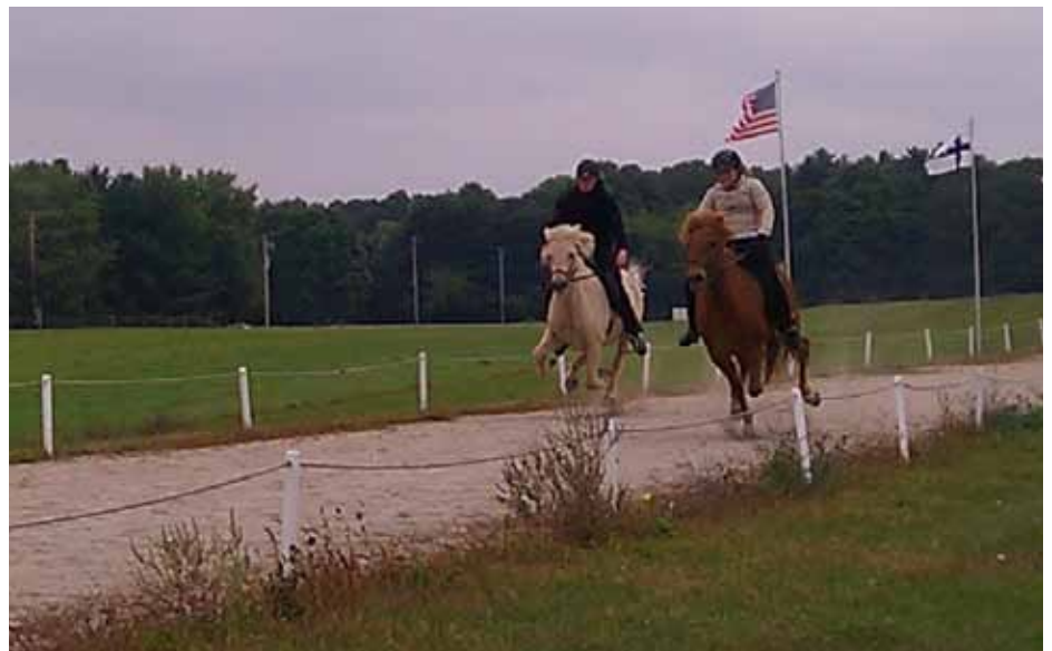
The exciting Canter Race (really gallop) at the 2011 Flugnirkeppni in Wisconsin.