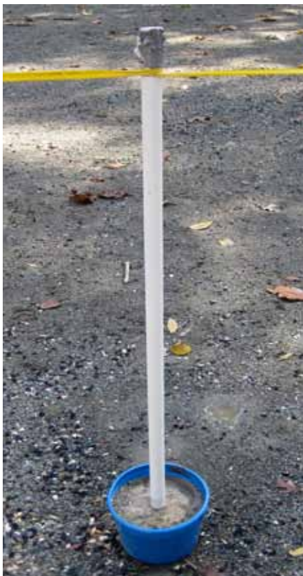
Close-up of a bucket, pipe, and tape array—the building blocks of your longeing circle.

ing circle, however, is asking for trouble. Once it learns it can get away from you and break the plastic or jump over it you have lost the game.