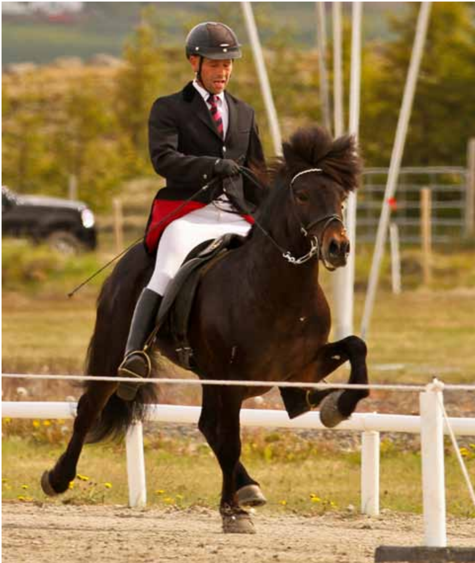
The five-year-old stallion Spuni fra Vesturkoti is the highest judged Icelandic horse in history, with an overall score of 8.87.

at the evaluation scores for prospective mates and decide which ones you would like to combine. Purchasing or leasing high-scoring or first-prize horses may get expensive, but the results could be gracing your pasture in less than a year instead of 15. But, can you really depend upon official scores to determine the parents of your dream horse?