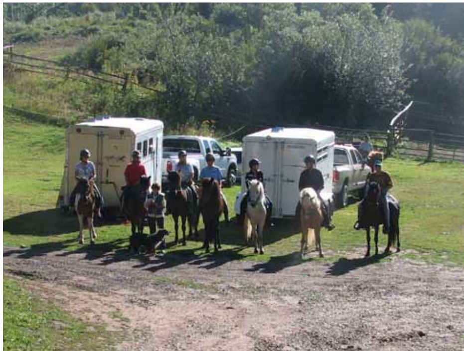
Members of the Klettafjalla Club ready to ride out on the trail at Coulter Lake Ranch in the White River National Forest of Colorado.