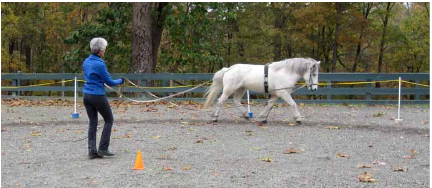
Longeing on a double longe in the circle. Says Nicki, “I really like this photo of Haukur Freyr trotting in a nice frame, being very relaxed. I am gently encouraging with my body language, and the longe lines are loose like they are supposed to be.”

Why double longe, one might ask? Wouldn’t a single one do the same job?