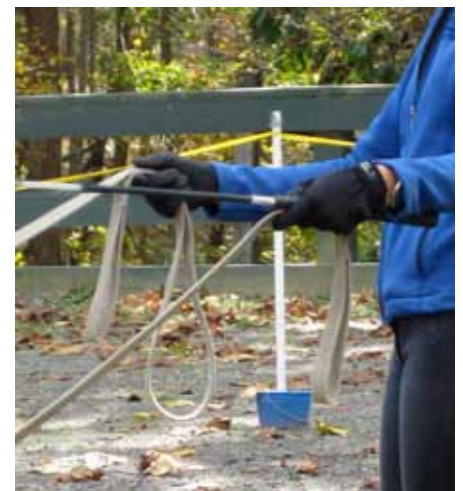
Here's a close-up of how to hold the longe line in loops, not wrapped around your hand.

Place one pipe bucket at the center of your intended longeing circle. Slip the loop of your longe line over the pipe and walk out to the end. Using your heel or a stick, mark a circle around the middle, the radius being the length of the longe. Put away your longe line and replace the center pipe bucket with a small cone. Place one pipe bucket on the circle line and one directly opposite, using the cone to sight a straight line. Then put one bucket at 3 o'clock and one at 9 and divide the rest up evenly. String the plastic tape along at the top of the pipes, and tie a loop at the end, so you can use the last space as a "gate." Done!