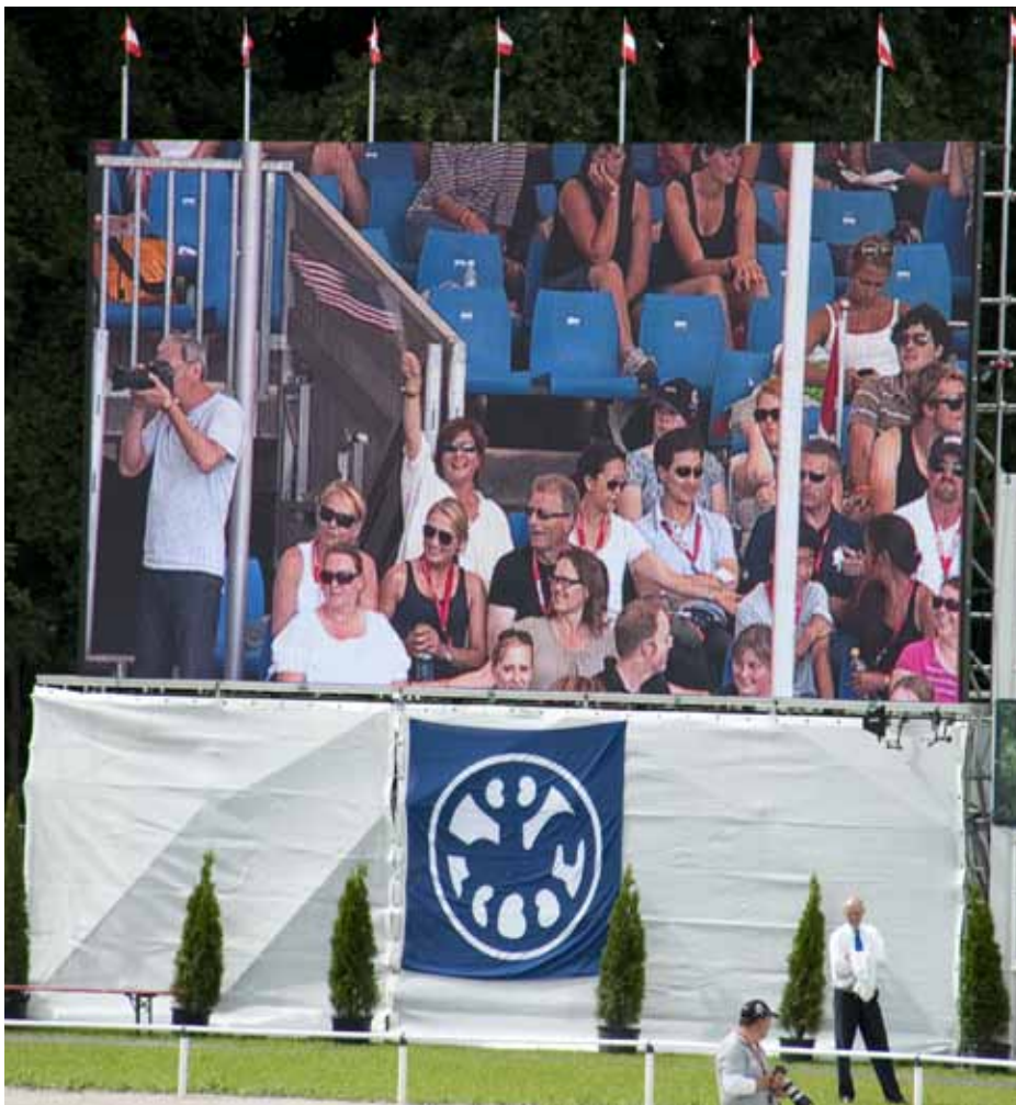
The U.S. was represented by about a dozen fans in the stands. The team was also supported by a groom, team trainer, and team leader.