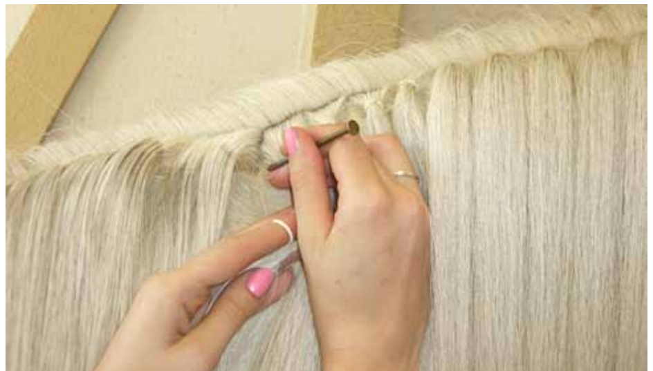
Close-up of how to use a nail to divide the cleaned, parted, and well-combed mane into clumps for banding.

11. Now is the time to add your leave-in