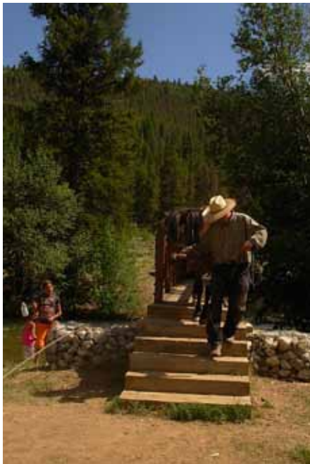
Pete leads Signy across a bridge on Clear Creek.

and repair. We ordered a new saddle for Raudi, a bitless bridle for Sigg, a pack saddle, saddle pads, rigging, ropes, shipping boots, feed bags, collapsible water bags, and hobbles. We also economized by ordering a new tent pole for our older two-person tent, and sewing the rips in our down sleeping bags.