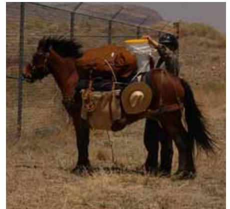
Signy at Del Norte, CO.