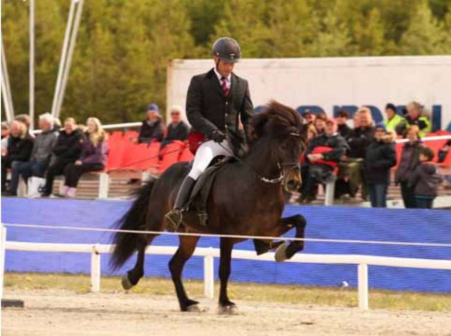
Spuni's high-stepping trot.