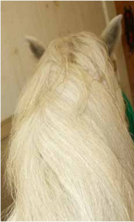
All washed and brushed straight back, Thor's mane is ready to be parted and banded.

his neckline more visible and attractive. His mane has never stayed split, even though the neck does not fall one way or another. That is just the luck of the draw.