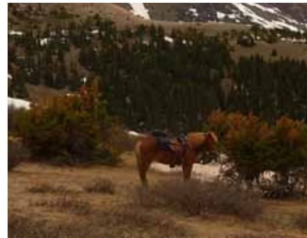
Crossing Cumberland Pass in Colorado, the trekkers encountered unexpectedly deep snowfields.

finally decided that should any of us show signs of distress, we'd retreat to pre-determined base camps.